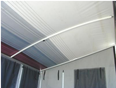
FITTED IN CONJUNCTION WITH ANTI FLAP KIT AND WALLS