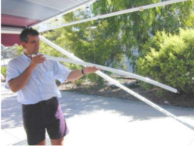
RAFTER RETRACTED FOR TRAVEL

The Curved Roof Rafter is particularly effective when used in conjunction with our Anti Flap Kit, with or without the addition of walls.