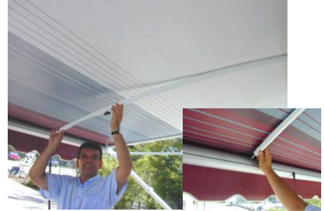
EXTEND OUT FRONT TELESCOPIC SECTION AND FIT SPIGOT INTO HOLE IN ROLLER