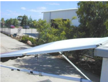
SHOWS CURVED ROOF RAFTER IN POSITION