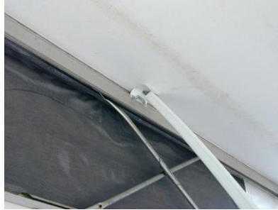
FIT POLE END INTO WALL BRACKET FIXED TO SIDE OF VAN