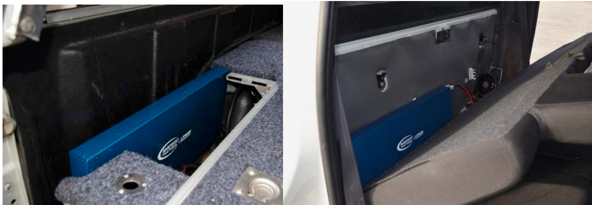
Figure 2 illustrates some handy stowage solutions. The primary benefit of the slim battery is that it can tuck away behind or under a seat in a vehicle. Too often space is at a premium and the slim shape and design of the battery means it can be hidden away.

As with all battery installations, ensure it is securely strapped down or secured in place before heading out on the road.