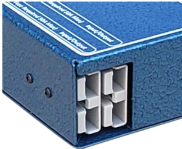
Figure 3 – Dual Grey Anderson Plugs

For connected chargers and devices, a grey Anderson plug must be used. Check to ensure the Anderson is correctly wired (positive and negative) and do not attempt to use any coloured Anderson other than grey.