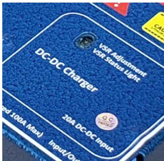
Figure 5 – DC-DC Charging Terminal Connections

The internal 20A DC-DC charger contains a Voltage Sensing Relay (VSR). As shown in Figure 5 the VSR has an LED status light and adjustment trim pot, which can be used to adjust at what input voltage (from the vehicle alternator / start battery) the DC-DC charger turns on and off. There is a dead-band of 0.5V, so that it typically turns on at 13.3V and turns off at 12.8V.