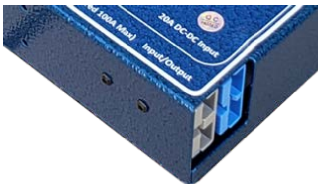
Figure 4 – DCS Model Anderson Connectors

The blue connector is reserved for a DC input, to make use of the internal DC-DC charger. The DC-DC charger is rated for 20A input from a vehicle alternator or start battery.