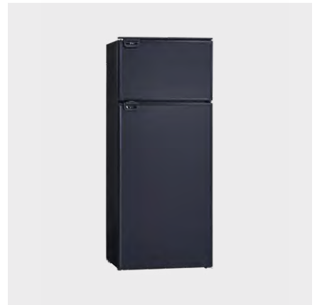
DC230X 230L 12V / 24V