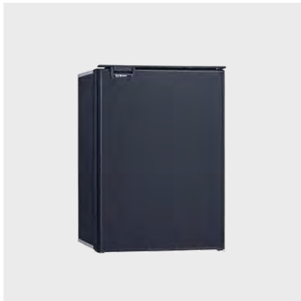
DC130X 130L 12V / 24V