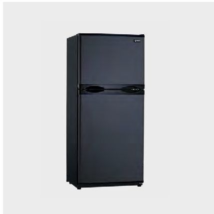
DC190L 190L 12V / 24V