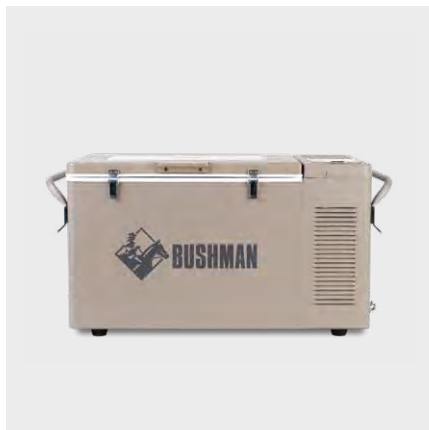
Original Bushman SC35 35L 12V / 24V FRIDGE / FREEZER