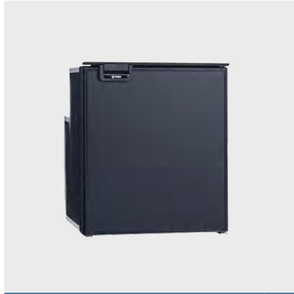
DC65X 65L 12V / 24V