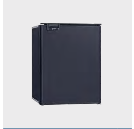
DC85X 85L 12V / 24V