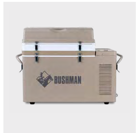
Original Bushman SC35-52 35L-52L 12V / 24V FRIDGE / FREEZER