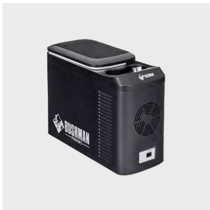
Roadie 15L 12V / 24V FRIDGE / FREEZER