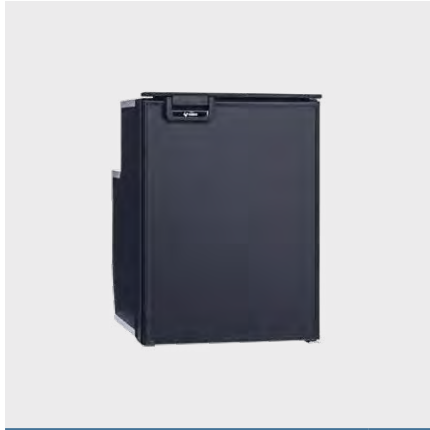
DC50X 50L 12V / 24V