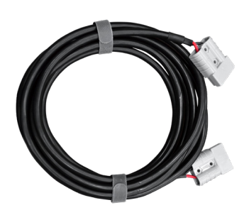
5m Extension Cable