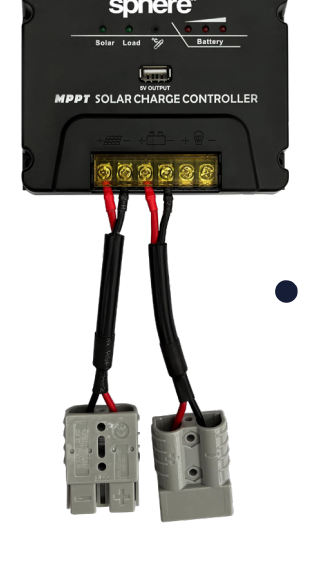
20A MPPT Controller