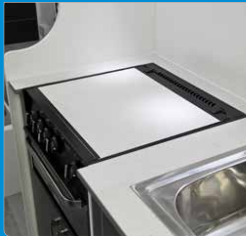
Lid with décor panel