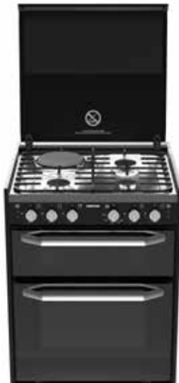
Dual Fuel Fan Forced Oven