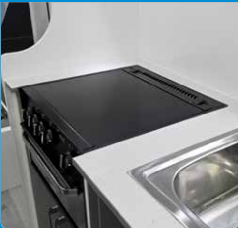
Lid without décor panel

Inquire with your caravan manufacturer or dealer regarding the options for your RV.