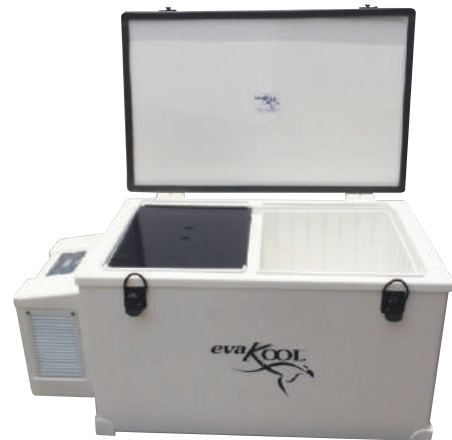
EvaKool RF Series - Standard Model