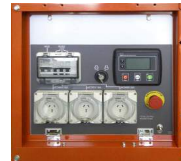
GL-9000 CONTROL PANEL