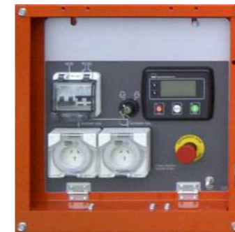
GL-6000 CONTROL PANEL

The Kubota super mini vertical diesel engines are water cooled and have increased performance for dependable horsepower and when direct coupled to the generator, provide continuous power output levels with minimum power loss.